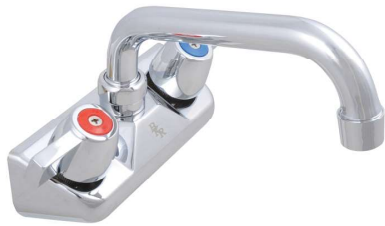
4" CENTER WALL MOUNT FAUCET

FROM 6" TO 14" SWING SPOUTS, DOUBLE O-RING SPOUT SEAL, 1/4 TURN CERAMIC CARTRIDGES, POLISHED NICKEL CHROME FINISH, LEAD FREE, NSF, cCSAus.