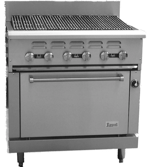
RR-36BR-126 Shown with Optional 6" Stub Back